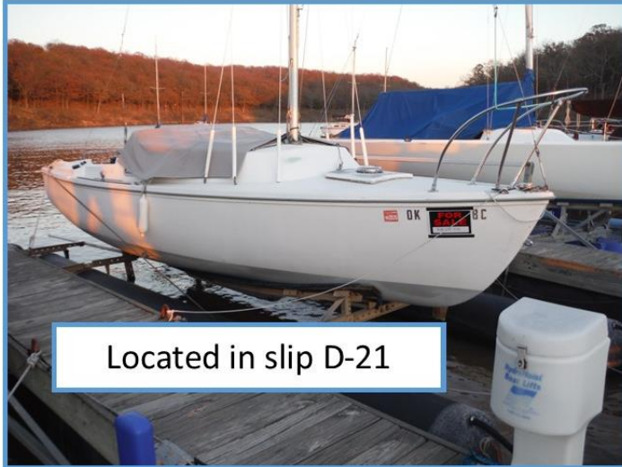
Located in slip D-21