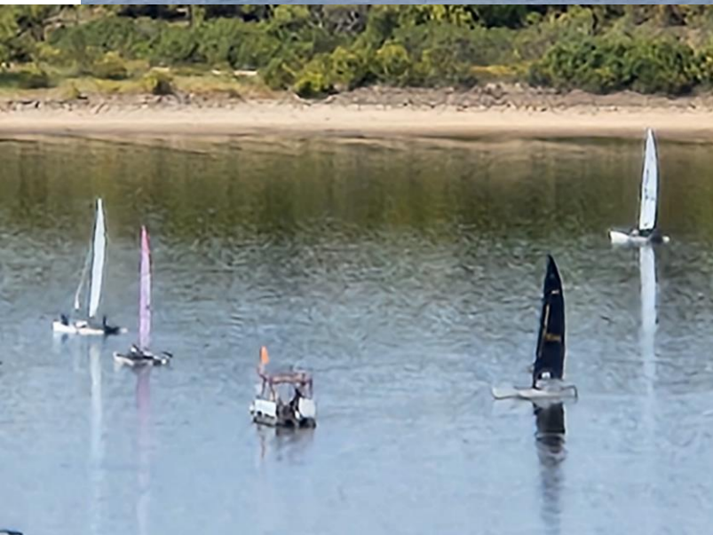
Above: Windycrest hosts the recent Hobie 17 & 18 event