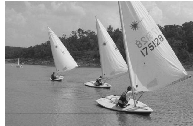
Downwind in light air, Windybow!l