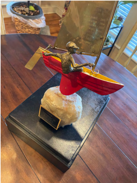
The Hobock Trophy, awarded to the first place centerboard boat at the Labor Day Long Distance Race.